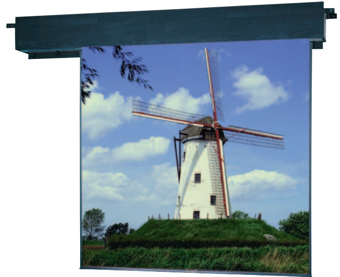
Matte White fabric up to 16' high will be seamless. Glass Beaded fabric up to 8' high will be seamless. High Power fabric up to 6' high will be seamless.

For optional remote control operation see options on pages 40-42.